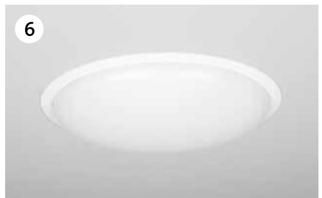
6 The installation is complete. Switch on the luminaire.