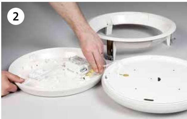
2 Separate the light unit and body.