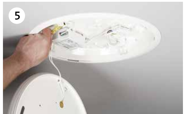
5 Attach the safety wire and connect the snap-in connector. Install the light unit in the body using a bayonet fitting.