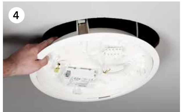
4 Draw the cabling into the luminaire and release the three locking springs. Install the luminaire in the hole.