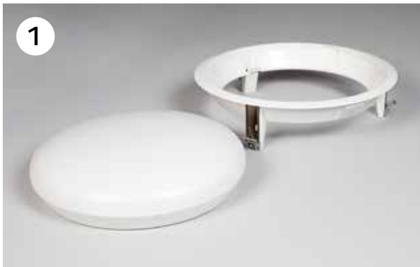
1 Recess ring and luminaire consisting of LED module, diffuser and body.

A large number of luminaires installed in often difficult-to-work spaces require efficient installation. Discover Evo is one of the quickest on the market. An innovative installation solution with body and recess kit provides a user friendly light package. The LED module and diffuser are placed together which makes the installation smooth and safe as the lighting element can be put to one side while the body is being installed.