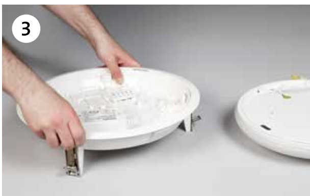
3 Place the luminaire body in the recess module and lock it with a click.